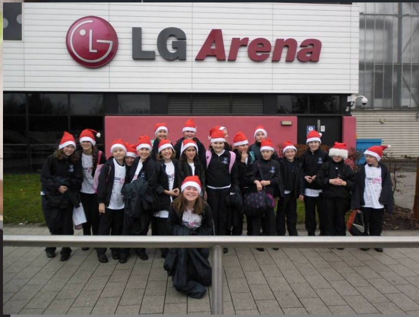
The team just before the event at the LG Arena in Birmingham